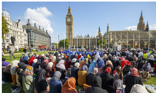
Encroaching upon Big Ben in London.