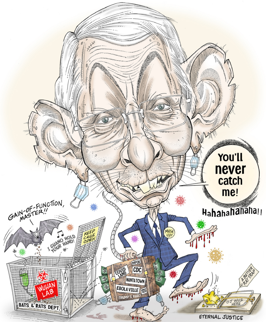
Another Rodent Virus Outbreak